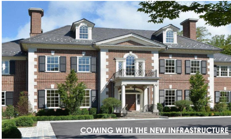
COMING WITH THE NEW INFRASTRUCTURE