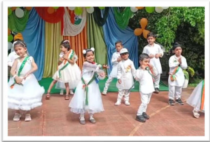
LITTLE STARS OF KINDERGARTEN AND NURSERY PERFORMING ON 78 TH INDEPENDENCE DAY