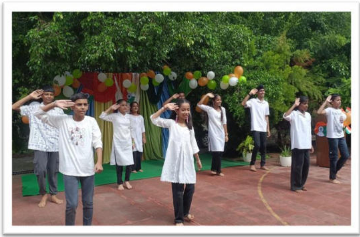
STUDENTS PERFORMING GROUP DANCE