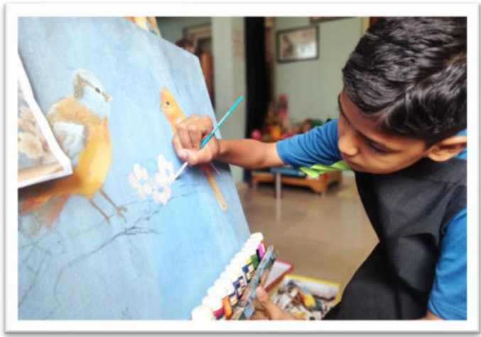
CANVAS PAINTING INSPIRED BY NATURE