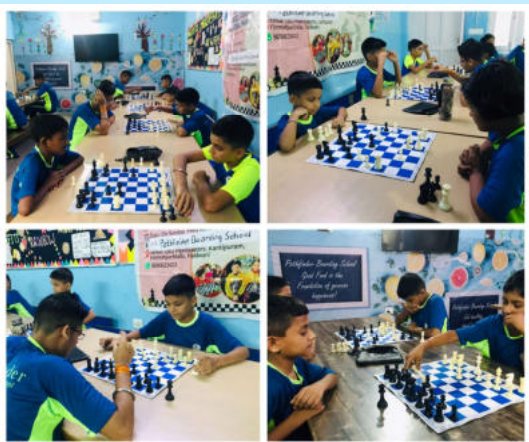
Chess Tournament: Students Showcase Strategic Brilliance in School Tournament.