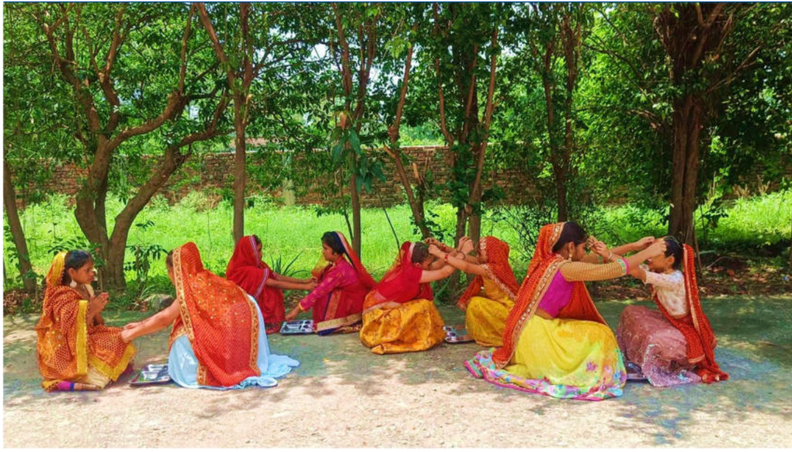
Harela Celebration: Group of students performing regional dance on the occasion.