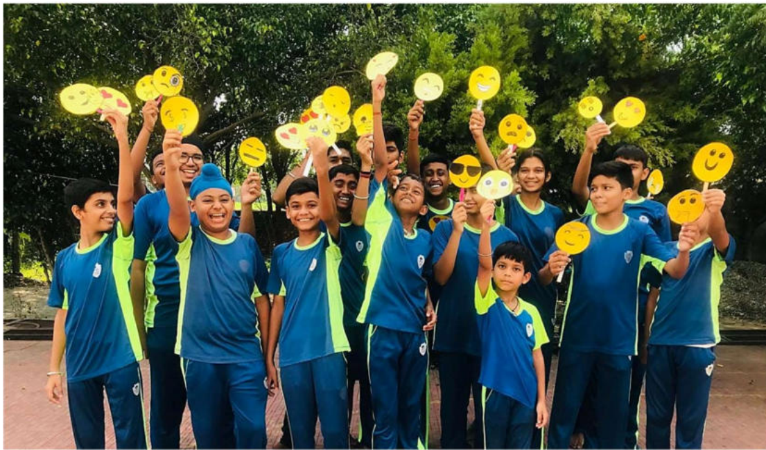
International Emoji Day Celebration: Students posing with selfmade emojis.